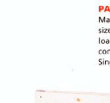
PACK GLASS TROLLEY Manufactured to hold two stock size packs of glass allowing easy loading/unloading via open base construction Single-sided option available