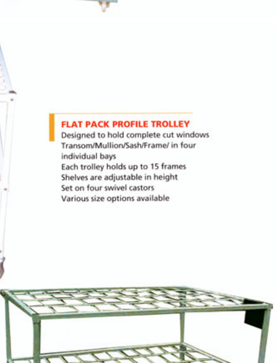
FLAT PACK PROFILE TROLLEY Designed to hold complete cut windows Transom/Mullion/Sash/Frame/ in four individual bays Each trolley holds up to 15 frames Shelves are adjustable in height Set on four swivel castors Various size options available