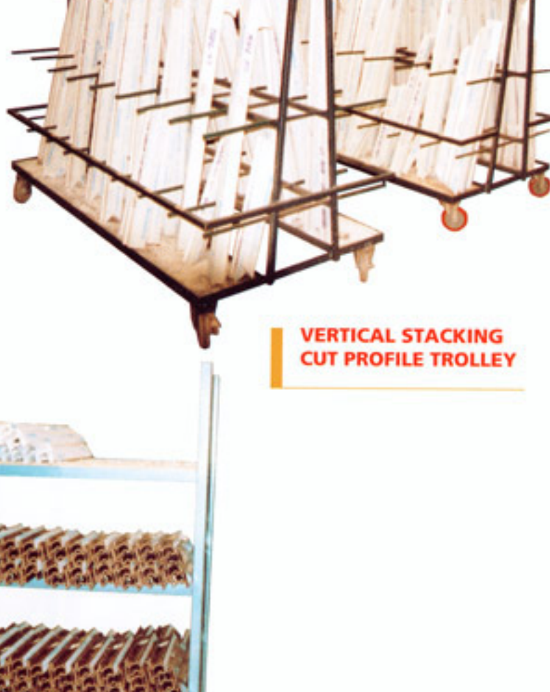
VERTICAL STACKING CUT PROFILE TROLLEY