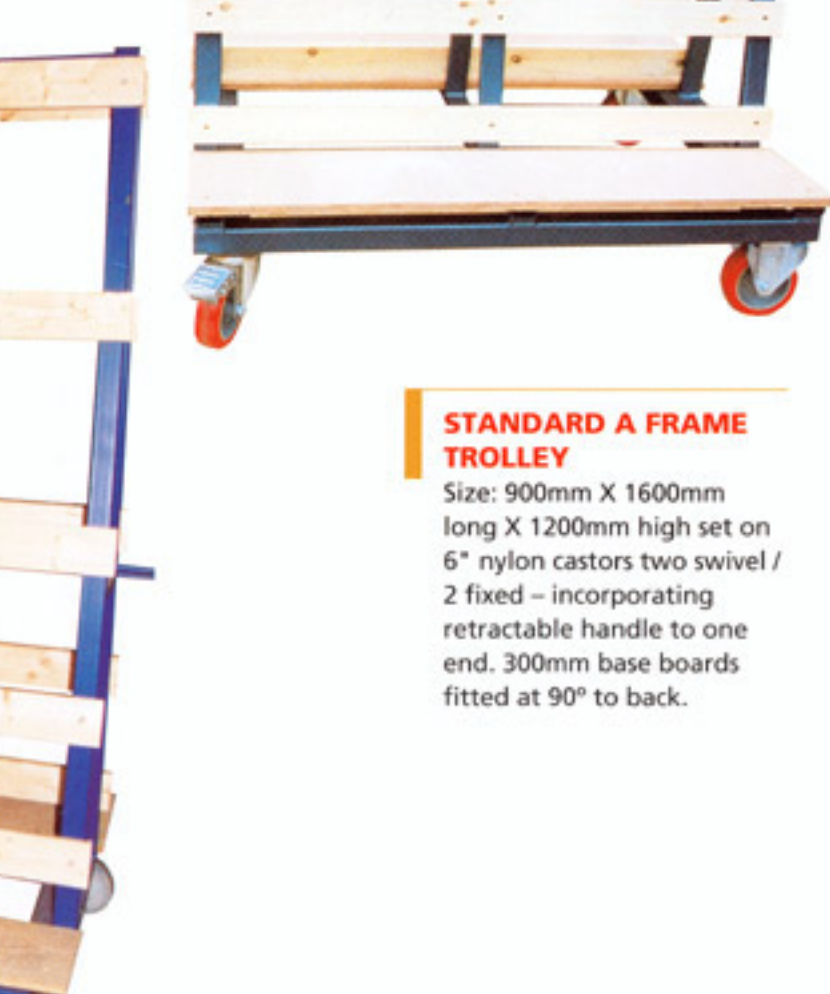
STANDARD A FRAME TROLLEY Size: 900mm X 1600mm long X 1200mm high set on 6" nylon castors two swivel / 2 fixed – incorporating retractable handle to one end. 300mm base boards fitted at 90° to back.