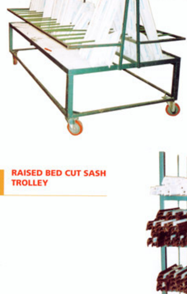
RAISED BED CUT SASH TROLLEY