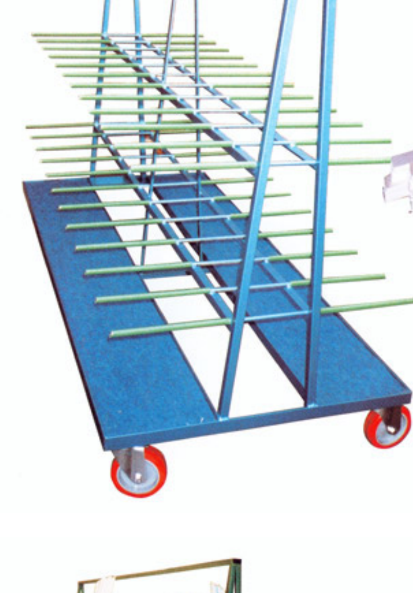
VERTICAL STACKING CUT PROFILE TROLLEY Standard Cut Profile Trolley 12 gaps at 150mm per side Bars sleeved in plastic hose Set on 6" nylon swivel castors Please note: various sizes available p/a