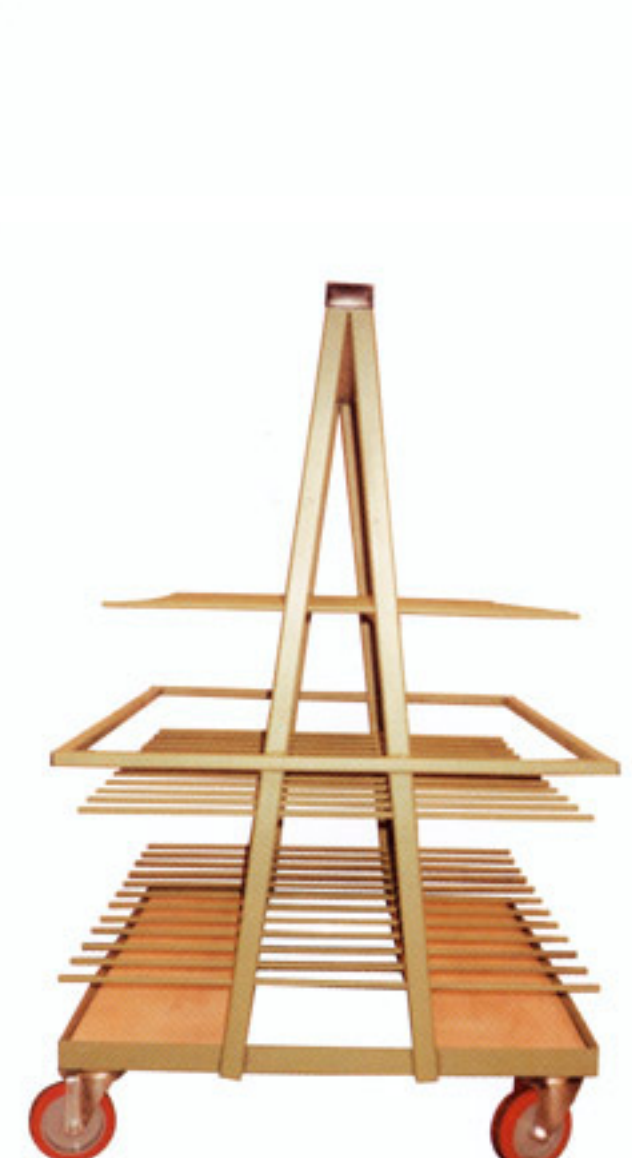
CUT STEEL INSERT TROLLEY Designed to hold various sizes of bulk cut steel inserts Heavy construction chassis 11 bays per side @115mm gap Set on 6" nylon swivel castors