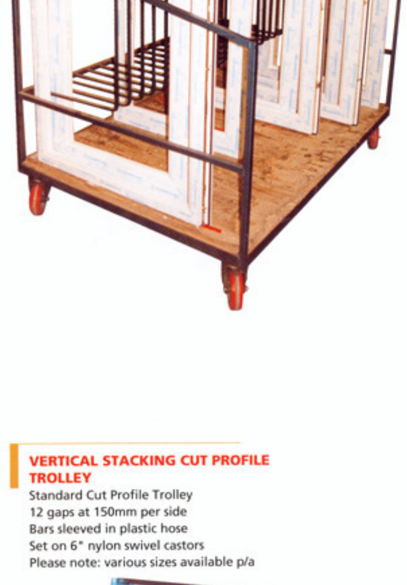
COMPLETED FRAME TROLLEY Designed to hold batches of 10/12 part-finished / finished frames Set on 6" nylon swivel castors Allows access to any individual frame