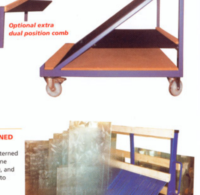
OPTIMISED GLASS TROLLEY For batch cutting of glass. Designed to hold 60 paired glass