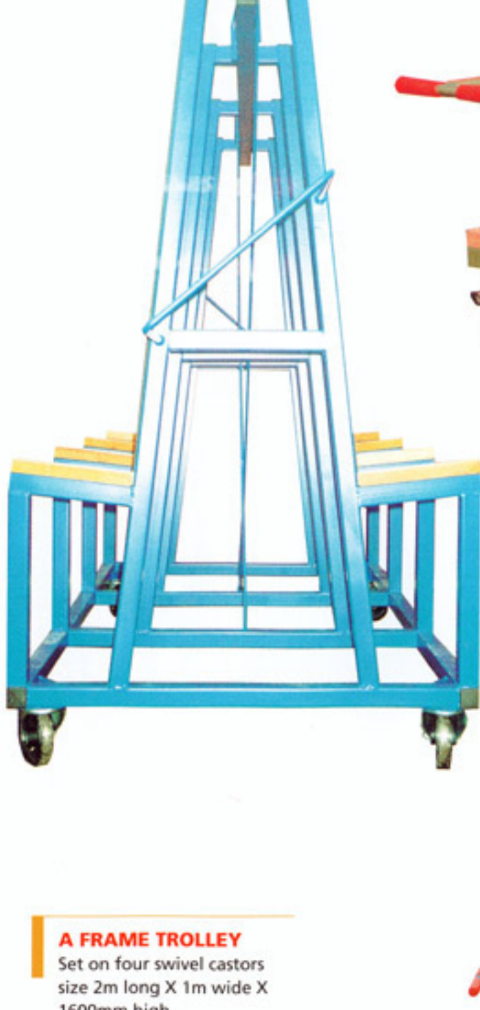
A FRAME TROLLEY Set on four swivel castors size 2m long X 1m wide X 1600mm high.