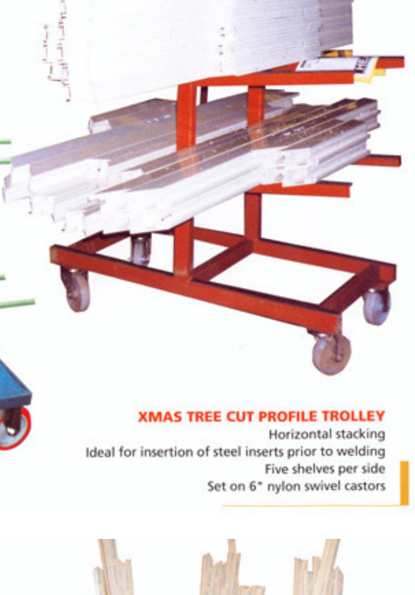
XMAS TREE CUT PROFILE TROLLEY Horizontal stacking Ideal for insertion of steel inserts prior to welding Five shelves per side Set on 6" nylon swivel castors