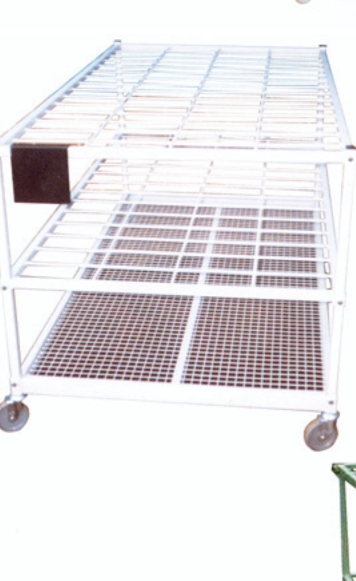
HORIZONTAL STACKING PROFILE TROLLEY